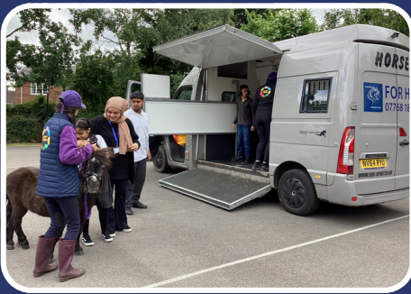
Let's Enable Pony visits