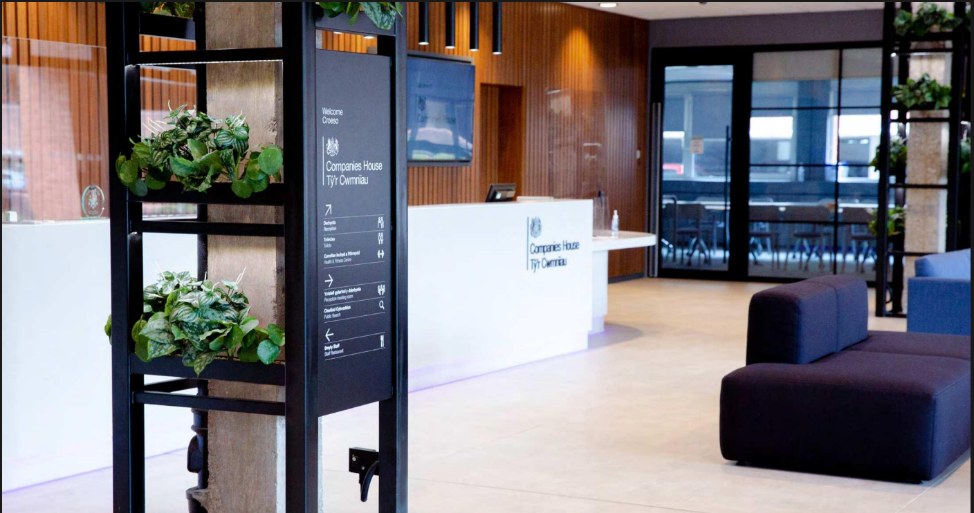
Companies House. Head office reception, Cardiff.