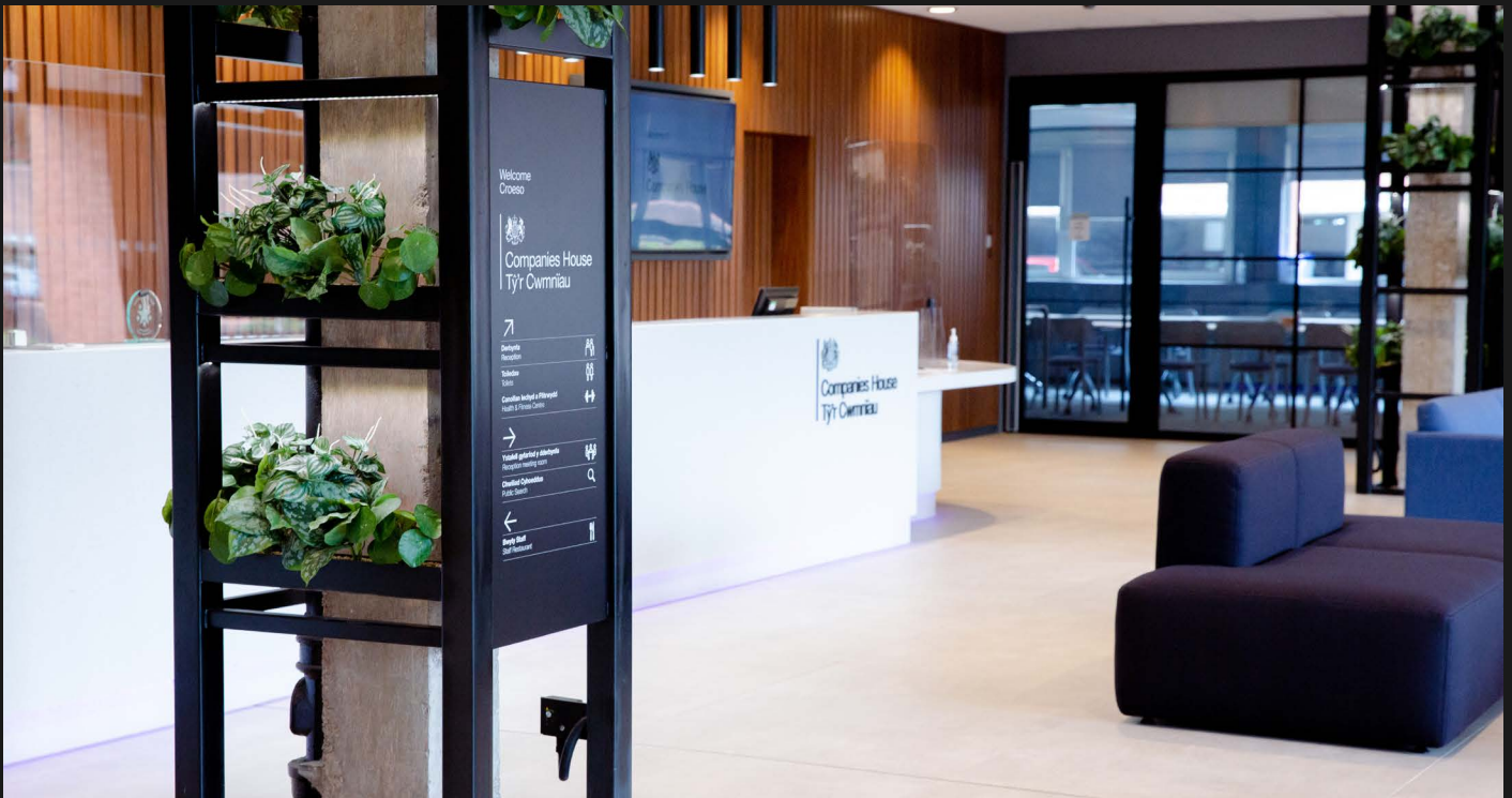
Companies House. Head office reception, Cardiff.